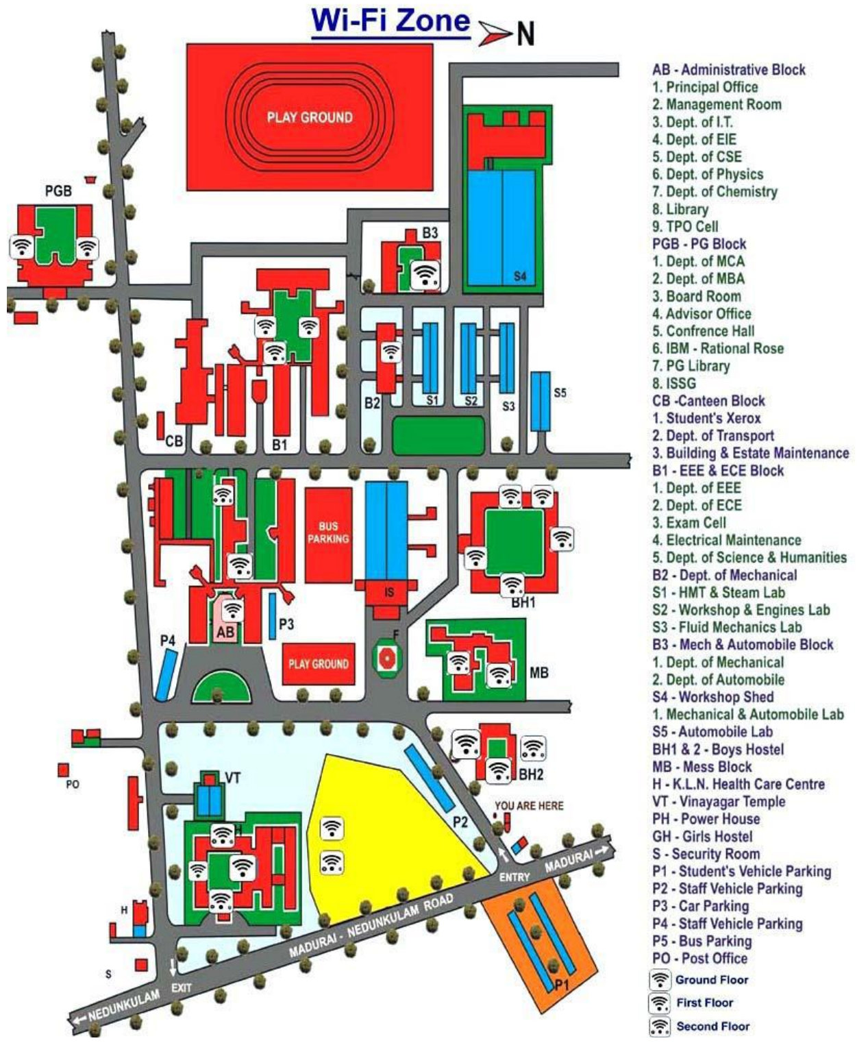
Structure of College WiFi